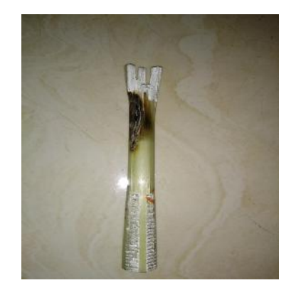
Figure 6: Brittle Fracture