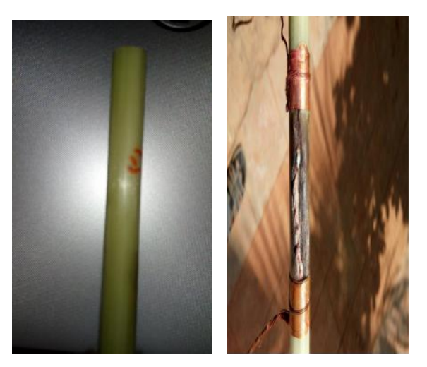
Before TestingAfter Testing at 1.6KVFigure 4: FRP Rods Before and After the Tests