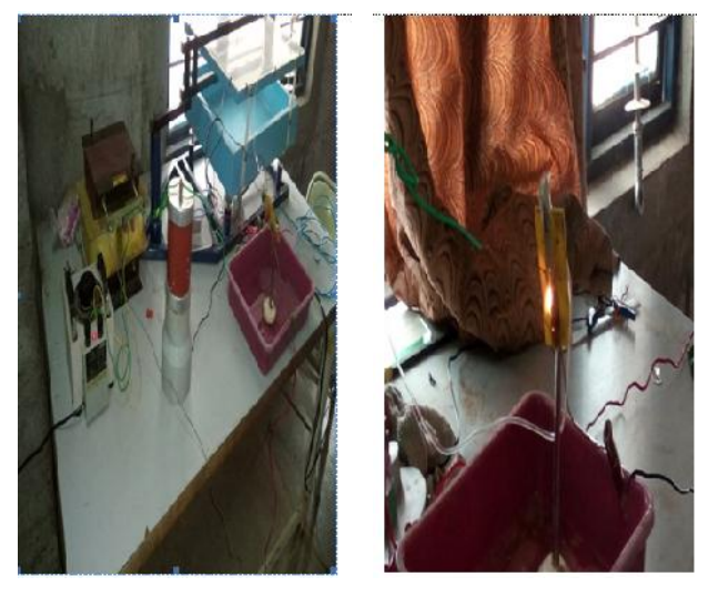
Figure 3: Test Arrangement for GRP Rod