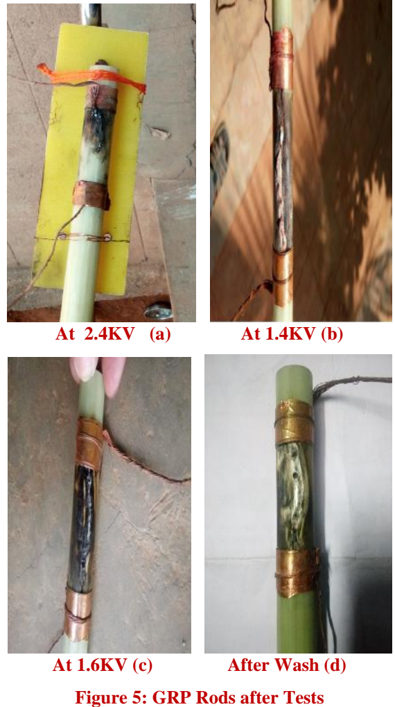
rigure 5. Okt Kous after